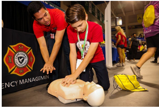
(5) A Southwest Florida eighth grader practices CPR as part of Junior Achievement of Southwest Florida's 'Inspire' hands-on career expo held at FGCU recently.