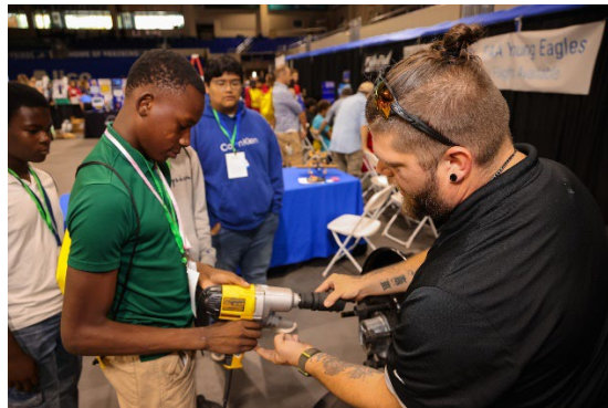
(6) A local middle schooler takes part in one of the hands-on activities at the recent 'Inspire' career expo hosted by Junior Achievement of Southwest Florida.